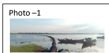
Over View of RFF site.