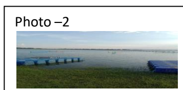
Over View of RFF site.